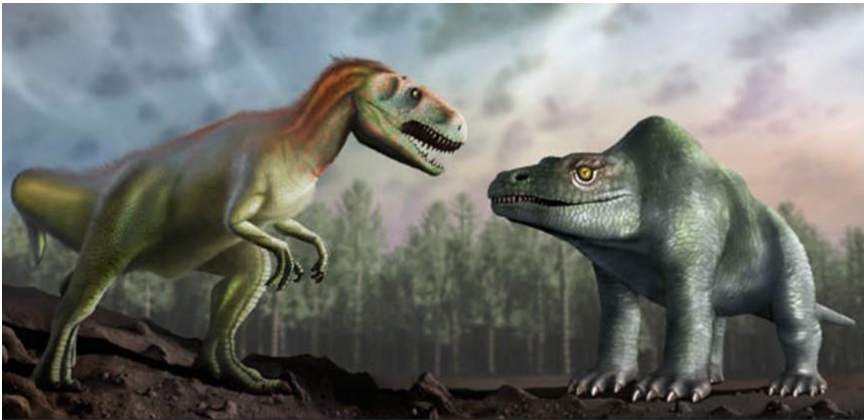
Artist's impression of how Victorian palaeontologists thought Megalosaurus bucklandii looked (right), compared with how we now understand it to have looked (left).

While dinosaurs as such are science fact, they have always featured in SFF stories, starting from early examples such as A JOURNEY